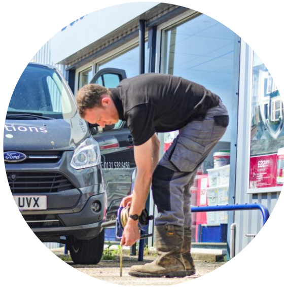
PRINCIPAL ENVIRONMENTAL CONSULTANT